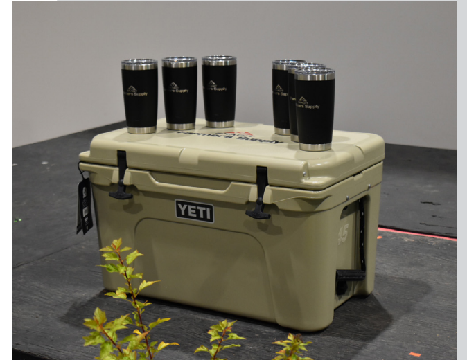
Door prizes contributed by Skagit Farmers Supply.

For more information about Whatcom Family Farmers, visit whatcomfamilyfarmers.org .