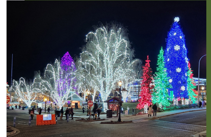
Leavenworth, WA, the site of our 2024 Winter Grower Education Meeting.