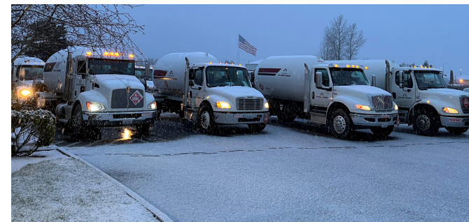
A portion of the SFS fleet getting ready to deliver clean-burning propane gas.

Welcome to our winter update! As the season unfolds, familiar weather patterns are emerging—warmer days and cooler nights: a prelude to the anticipated winter deep freeze. Rest assured, our team is well-equipped and mentally prepared for whatever comes our way.