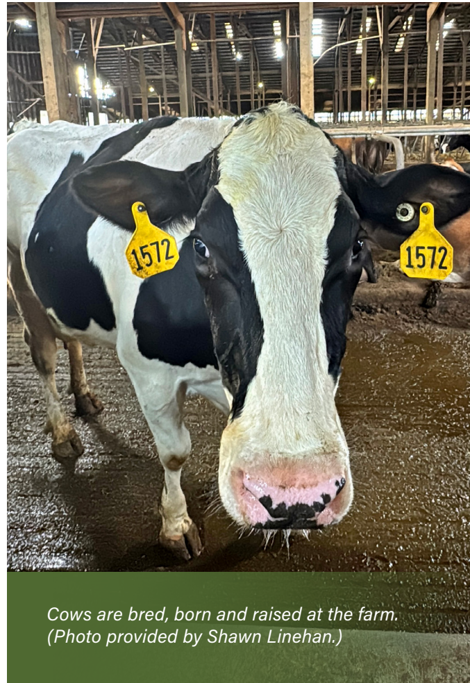
Cows are bred, born and raised at the farm.