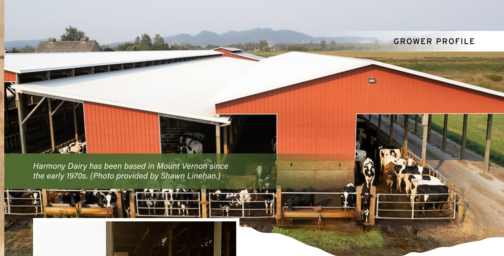
Harmony Dairy has been based in Mount Vernon since the early 1970s.