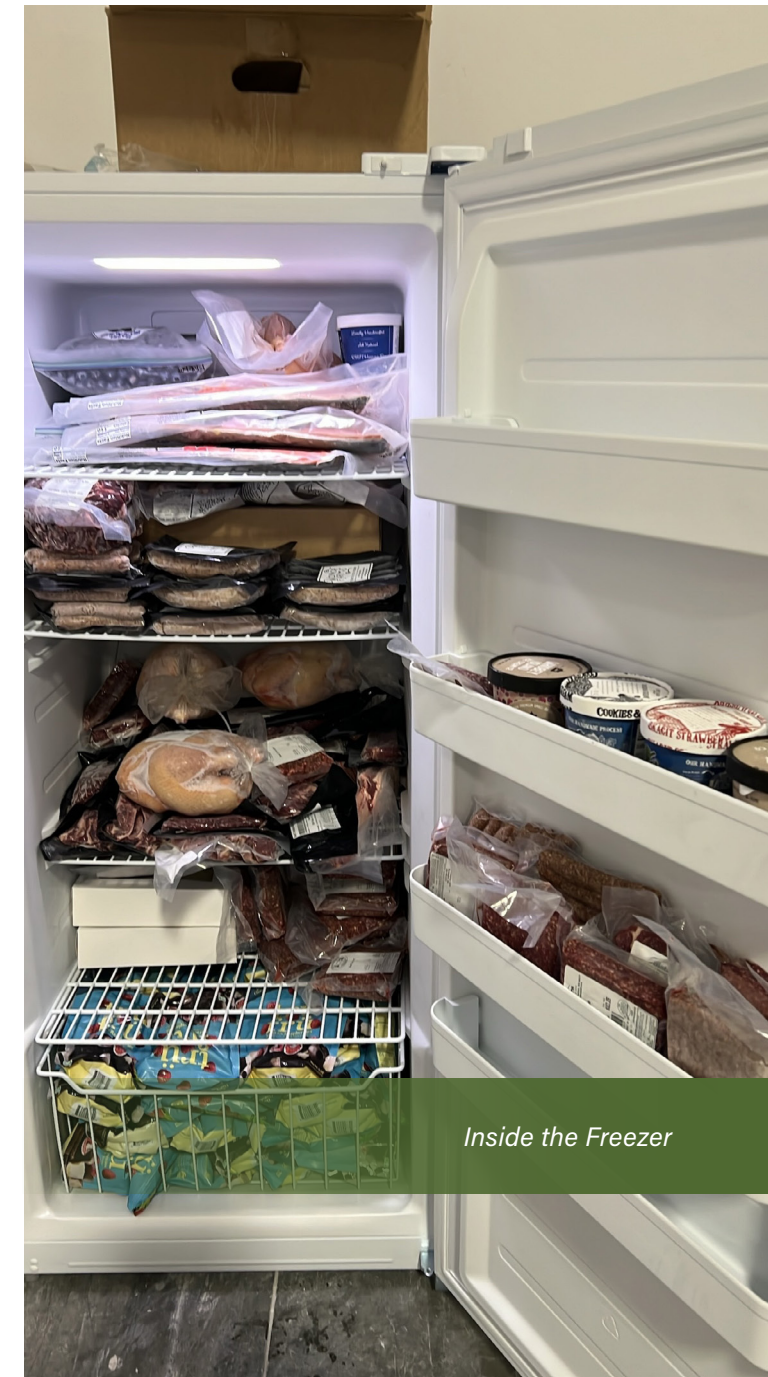
Inside the Freezer