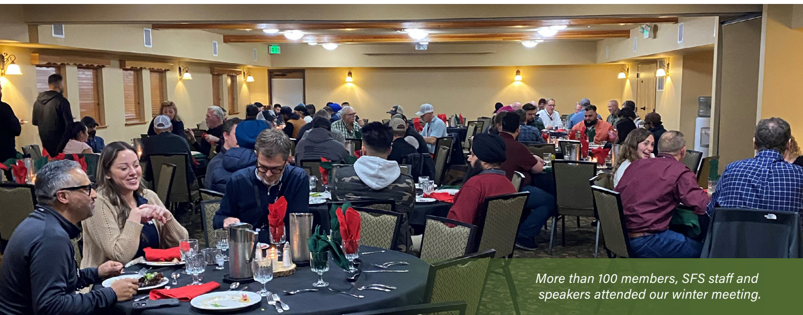
More than 100 members, SFS staff and speakers attended our winter meeting.