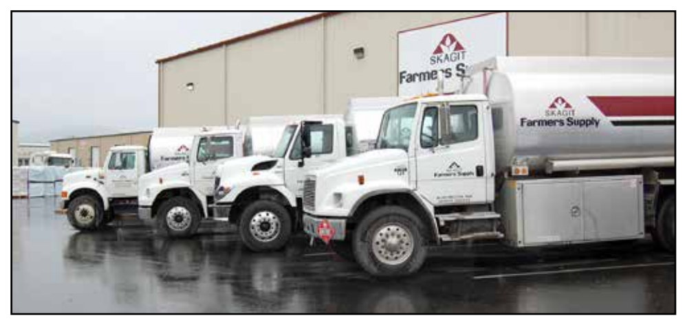
Four Skagit Farmers Supply trucks deliver heating oil to residences, gasoline and diesel to stations for resale, and energy products to farms.

Read his story on page 2. Ryan can be reached at 360-840-4324 or email ryann@ skagitfarmers.com.